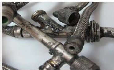
How to clean?